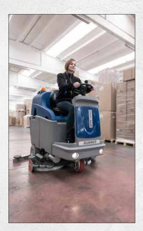
RUNNER R 150 FD 85 Scrubbing width 850mm Squeegee width 1050mm