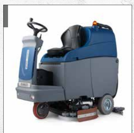
RUNNER R 150 RD 85 BC