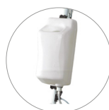
Tank 9 l