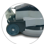
Articulation of the handle