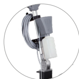
Spray electric system