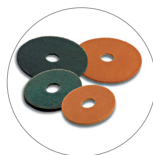
Various types of pads